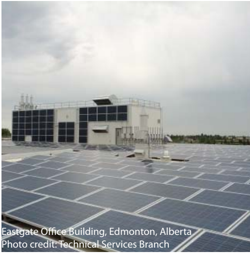
Eastgate Office Building, Edmonton, Alberta